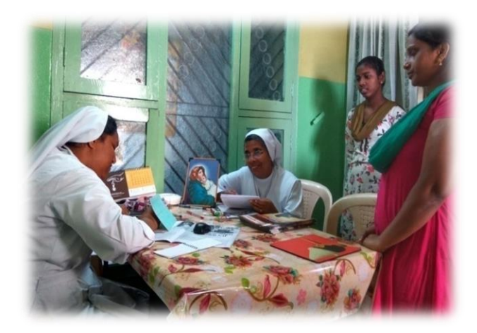
education of their children. FIDES is convinced that only education of children can bring up the social, cultural and financial status of the poor people.

On 16<sup>th</sup> July 2016, the remaining sponsorship money was distributed. There were around 40 poor families to receive the fund for the purpose of